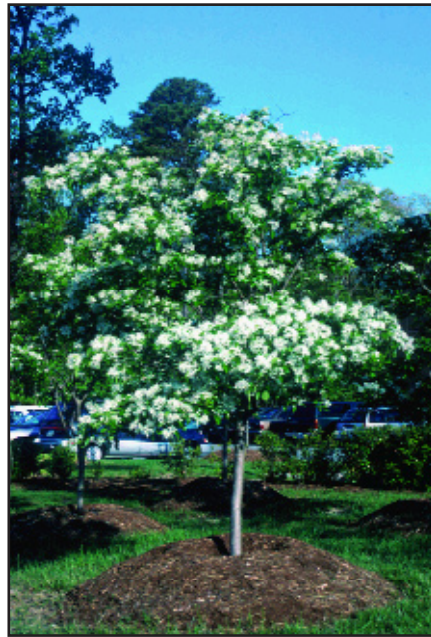
Salt tolerant tree – Chinese fringetree.