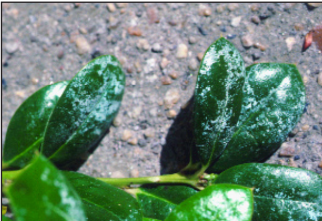
Salt deposits on a holly leaf after the water has evaporated.

Examine injury patterns on trees and shrubs. Winter salt spray damage to deciduous plants causes bud death and twig dieback. Tree and shrub growth after this damage will have a "witches-broom" (tufted) appear