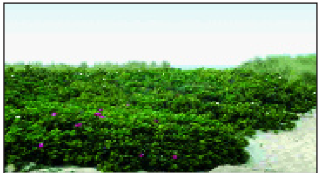
Salt tolerant shrub – Rugose rose.