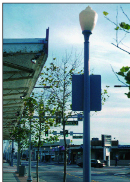
Top: Trees and shrubs "salt burned" on the windward side.