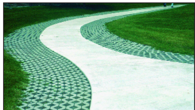
To reduce de-icing salt damage, open pavers have replaced turf along the sidewalk edge.