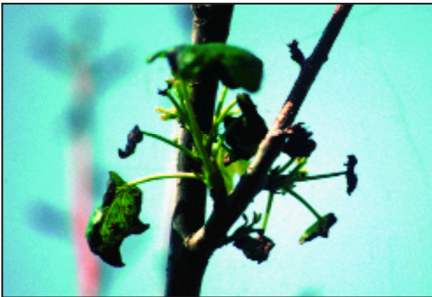
Salt spray damage on new sweetgum leaves.