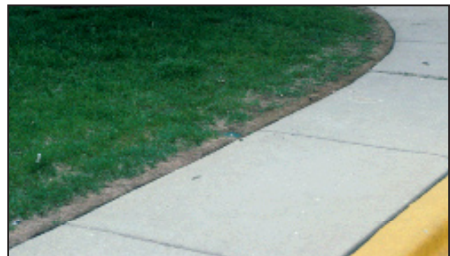
Turf along the sidewalk edge has been killed back by de-icing salts.