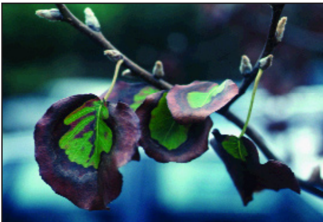
Salt spray marginal burn on Bradford pear leaves.