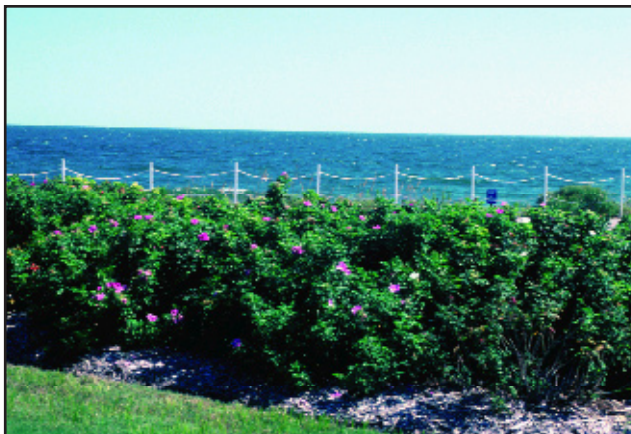
Salt tolerant rugose roses in a park bordering the Chesapeake Bay.